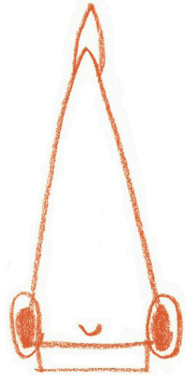
④ DRAW TWO SHADED CIRCLES INSIDE THE BIGGER OUTER CIRCLES. ADD A SMILE!