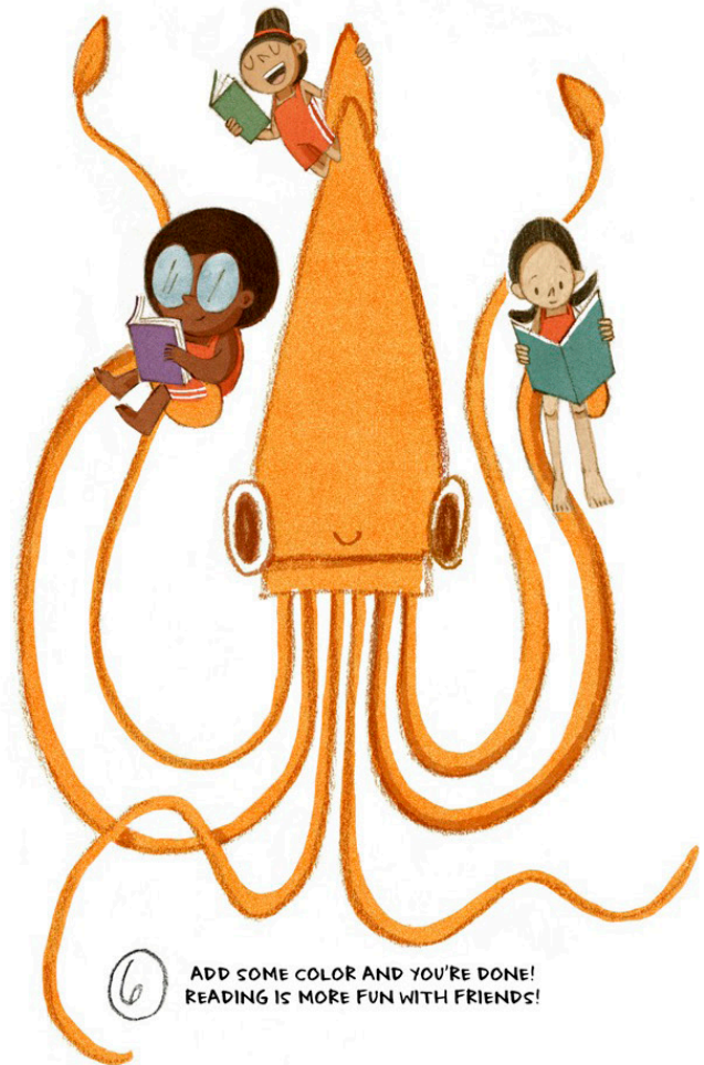
⑥ ADD SOME COLOR AND YOU'RE DONE! READING IS MORE FUN WITH FRIENDS!