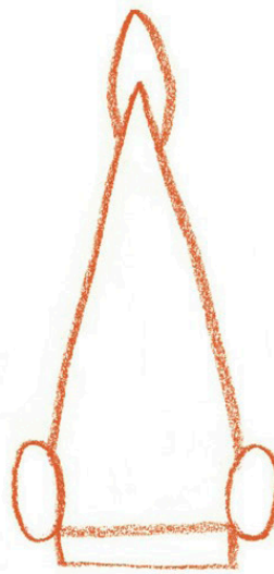
③ ADD TWO CIRCLES AND A RECTANGLE BELOW THE BIG TRIANGLE.