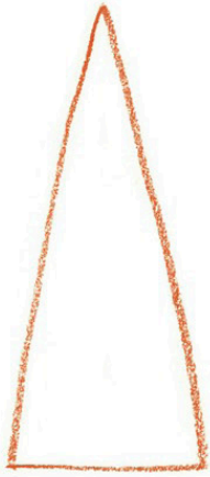
① DRAW A TRIANGLE