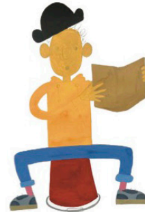
10: Start blocking in the colour - be brave and patient.