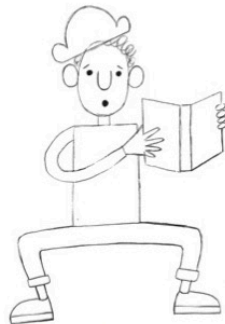
7: Next step is the legs and feet.