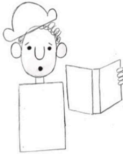
5: Move on to drawing the book - don't forget the fingers!