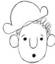
3: Next you can do the hair in any style you want - and the pirate hat.