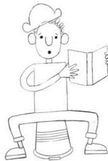
8: And now for the bucket - don't forget the handle!