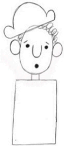
4: Now do a block shape for the neck and body.