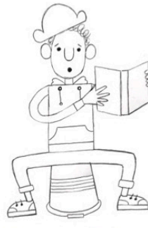
8: Time to pencil in the finer details.